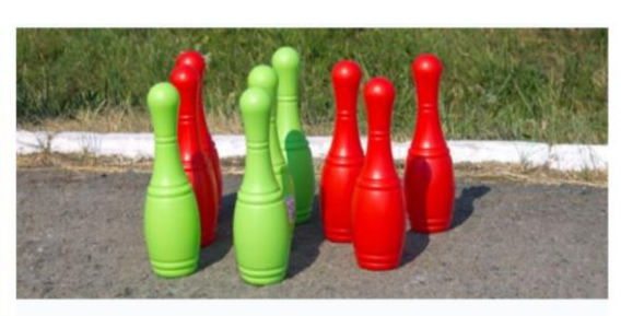
Count the number standing. Throw the ball and discover how many are knocked down and how many remain upright. This is addition and subtraction practice every time.